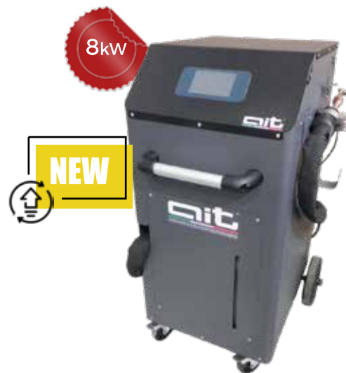
ART - HDi 8K400 TC