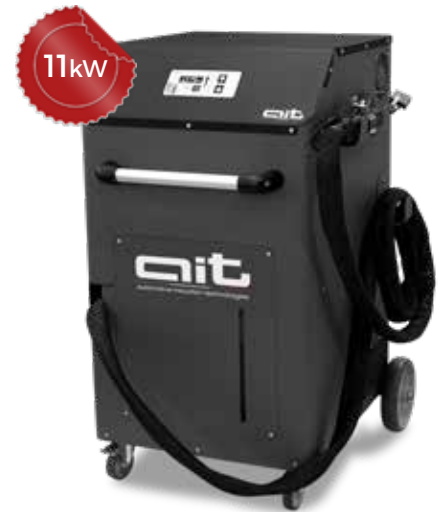
ART - HDi 11K400 KB