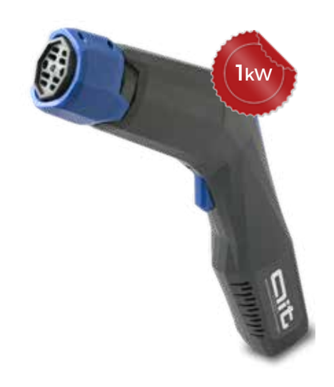
ART - II MV - 888