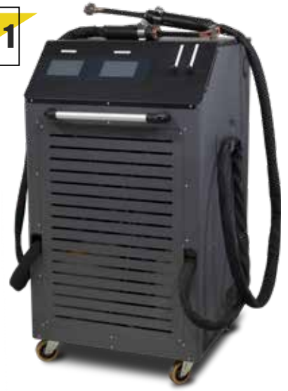
ART - HDi 11-11kW Biductor