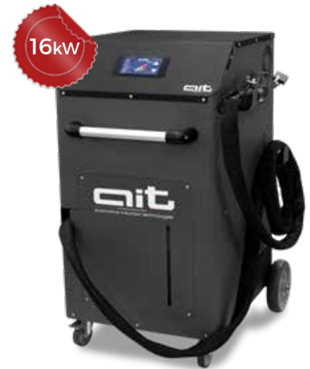
ART - HDi 16K400 TC