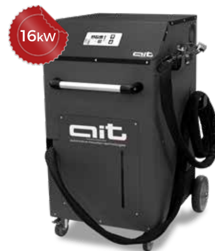
ART - HDi 16K400 KB