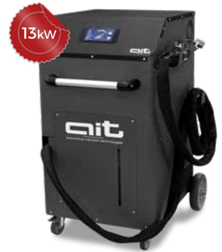
ART - HDi 13K400 TC