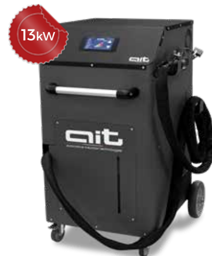
ART - HDi 13K230 TC