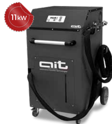
ART - HDi 11K230 KB